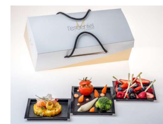
The Cabernet : €29,70 Vegetarian menu