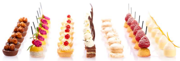
The « Passion » – €78,10

Platter of 42 petit fours, 7 varieties which may differ according the season