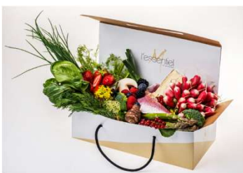
« Ballotin » of the day: €28,60 Daily menu

It is composed of a starter, a main course, a portion of cheese, a dessert, a 50cl bottle of still mineral water, a bread roll, cutlery and disposable napkins.