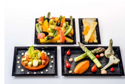
The Saint Emilion : €39,60 Vegetarian menu