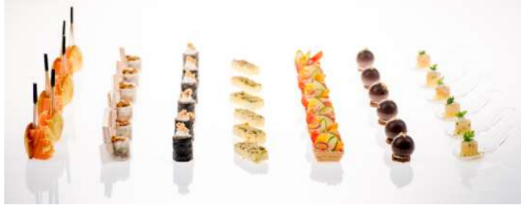
The « Epicurien » – €78,10

Platter of 42 savoury canapés, 7 varieties which may differ according the season