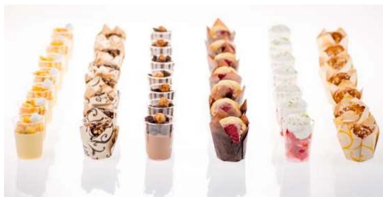
The « Gourmand » – €80,30

Suggestion of items: Caramel Carambar & chocolate tartlet / Exotic fruit dome & coconut biscuit / Meringue lemon tartlet / Chocolate & hazelnut crispiness / Succès pastry / Raspberry & pistachio financier / White chocolate cup, mandarin sauce, chestnut mousse.