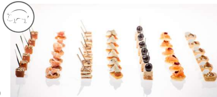
The « Gastronom » – €60,50

Suggestion of items : Salmon & lemon madeleine / Duck tartar / Lobster & duck maki / Comté millefeuille and nuts crumble / Vegetables tartlet / Chocolate & foie gras sphere / Fish tartar.