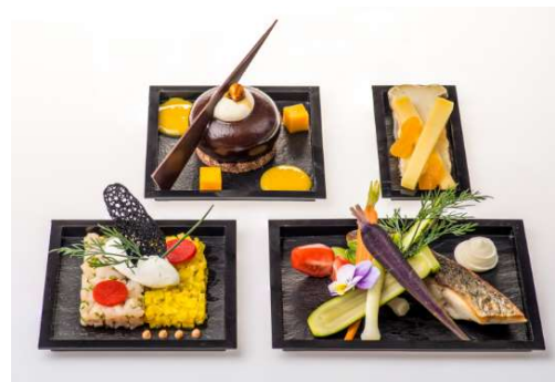
The Entre-Deux-Mers : €34,10 Fish based menu