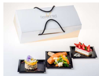
The Sauvignon : €29,70 Fish based menu