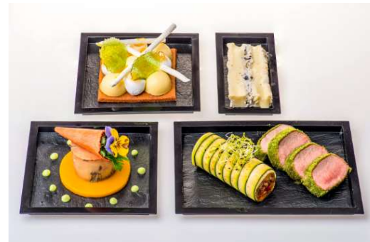
The Medoc : €39,60 Meat based menu