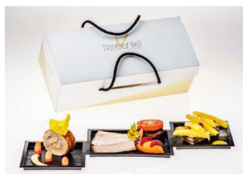
« Ballotin » of the month : €26,40 Meat based menu